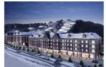
Packet & Times (Feb 2, 2012) Lance Holdforth

The units start at about $200,000 and will give buyers the opportunity to experience everything the resort has to offer, Latham said. The condo will put new residents in the middle of an adventure park, ski and snowboard hills and two championship golf courses. Buyers will receive resort VIP cards, which they can use before they move in and take advantage of 10% discounts on food and drink at any of the resort's restaurants, and also get unlimited access to on-site health facilities.